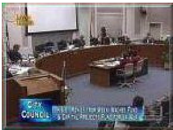
St. Pete city council meeting, December 20, 2007