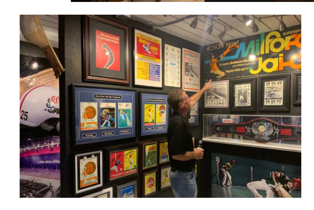
Come visit the Laca Sports Museum - only a half-hour away in Seminole.