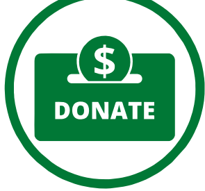
We need people to dig down deep and contribute to this incredible renovation we have embarked upon.